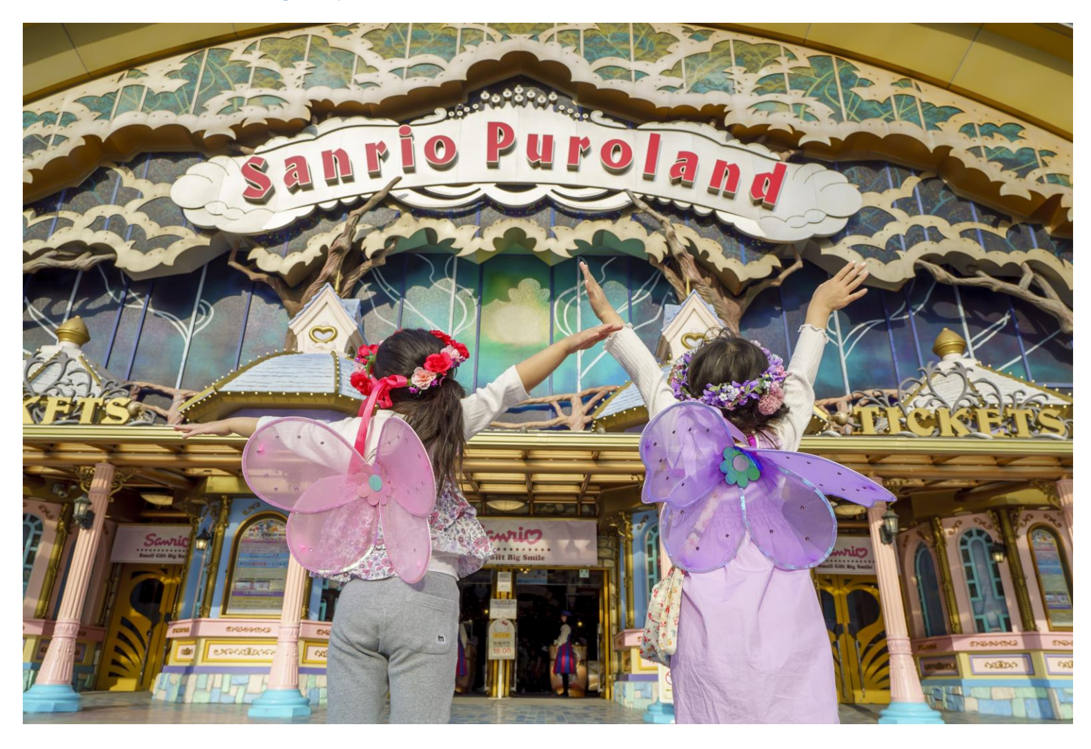
Sanrio Entertainment Co., Ltd. FACT BOOK