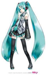
Hatsune Miku + PinocchioP