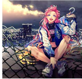
CHiCO with HoneyWorks