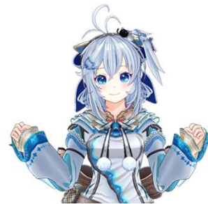
Dennou Shojo Siro