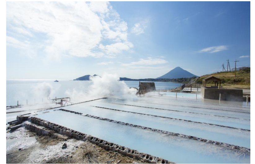
Yamakawa Salt Production Factory Ruins