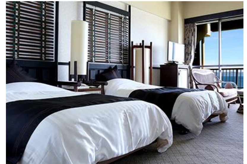
Japanese-Western style 48.3㎡ 2-5 pax, 3 Rooms