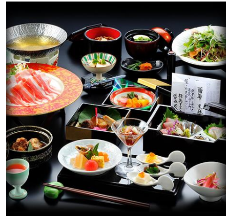
Course Dinner 18:30-20:00