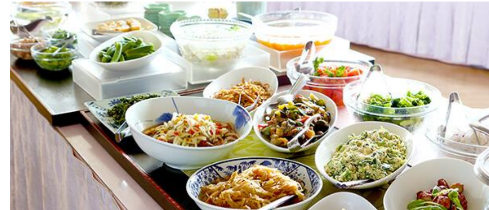
Breakfast Buffet 7:00-9:00