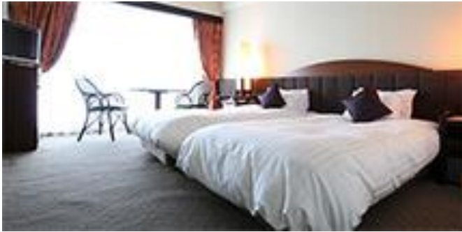
Western Style 24.6㎡ 2 pax, 12 Rooms