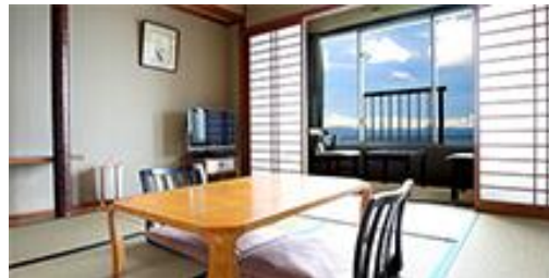
Japanese style 24.2㎡ 2-3 pax, 12 Rooms