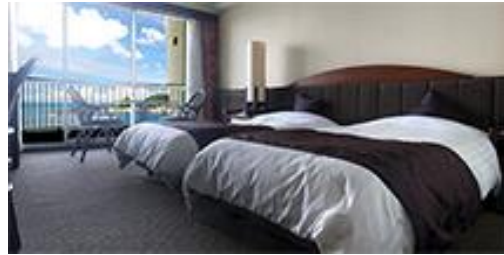
Western Style 24.6㎡ 2-3 pax, 24 Rooms