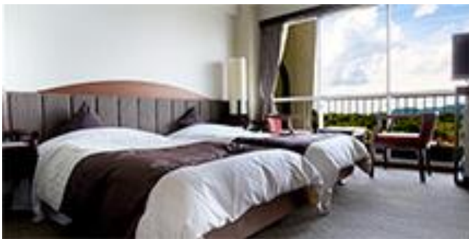
Western-Japanese Style 32.9㎡ 2-4 pax, 4 Rooms