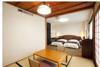
Japanese-Western style 34.2㎡, 3-4 pax, 12 Rooms