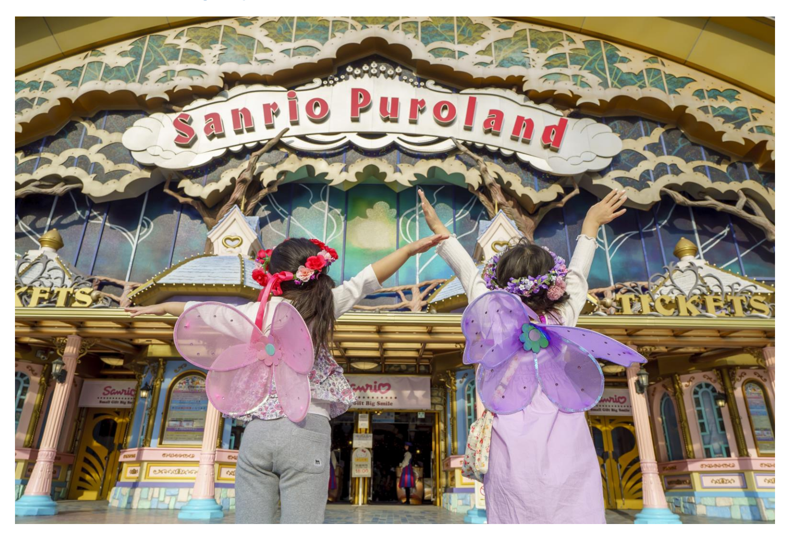
Sanrio Entertainment Co., Ltd. FACT